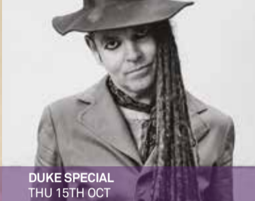
DUKE SPECIAL THU 15TH OCT