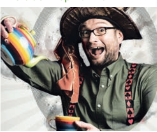
*** 'A cavalcade of brilliantly inventive puns' The Guardian