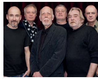
Long-time members bring much-loved songs, like 'Meet Me On The Corner' & 'Fog On The Tyne'.