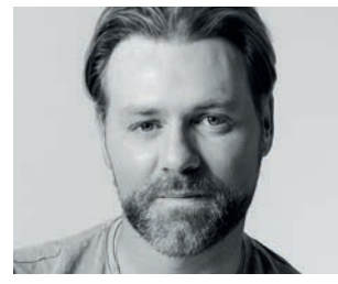
Former Westlife singer plays an acoustic set of Westlife & solo hits & soul classics.