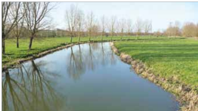
The Waveney at Mendham

Our second planned venture this year is the River Waveney Book Project. We propose to publish a book illustrating river views from Brockdish to Bungay, with each Trail artist including a piece of recent work. Preparatory drawings and additional pieces will be shown at the Waveney River Centre in August/September, in conjunction with Waveney & Blyth Arts River Sculpture Trail.