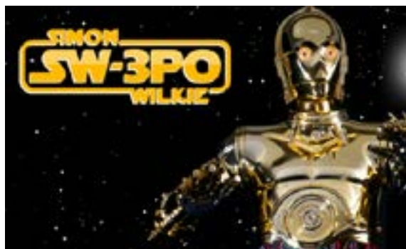
Have your photo taken with the Star Wars droid.

There are lots of free activities and there will be no charge for parking in the hospital car park (charges still apply in the public car park). Children under 16 must be accompanied by an adult.