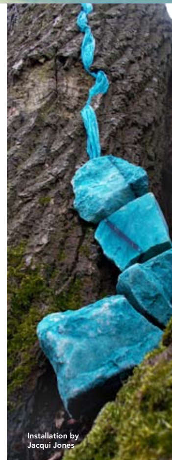
Installation by Jacqui Jones

Cost £2 per child Children love discovering the artwork along the trail and seeing the tame deer. To make the experience even more special come along to our drop-in children's outdoor art workshops, including make your own charcoal, wild drawing and sculpting with clay. All children must be accompanied by parents/carers. No advance bookings.